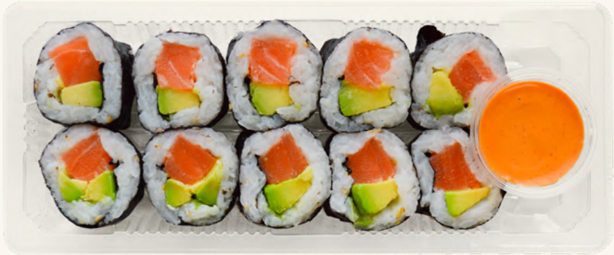
SALMON & AVOCADO ROLLS WITH GOCHUJANG MAYO

Product Code: AZ1 Barcode: 5060005532628 Shelf Life: 2 Days