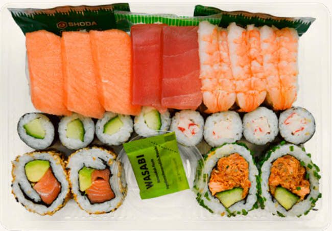
BIG BOY BOX

Perfect for two people, this vibrant selection features two tuna, three salmon, and three prawn nigiri with four cucumber and four seastick small rolls, alongside two spicy salmon and two salmon and avocado inside out rolls. Soy sauce wasabi and ginger included.