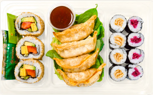
VEGE SUSHI ROLLS & VEGE GYOZA SIDE

A bento box containing three vege California rolls, four fried tofu small rolls, four pickled red cabbage small rolls and four vege gyoza with a sweet chilli soy dipping sauce. Soy sauce and wasabi included.