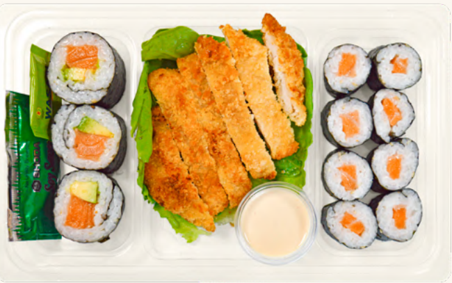
SALMON SUSHI ROLLS & CHICKEN KATSU SIDE

A bento box containing three salmon and avocado rolls, eight salmon small rolls and chicken katsu on a bed of lettuce with a sweet chilli mayo dipping sauce. Soy sauce and wasabi included.