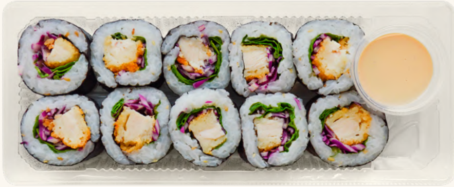
CHICKEN KATSU & RED CABBAGE ROLLS WITH SWEET CHILLI MAYO

Product Code: AZ2 Barcode: 5060005532635 Shelf Life: 4 Days