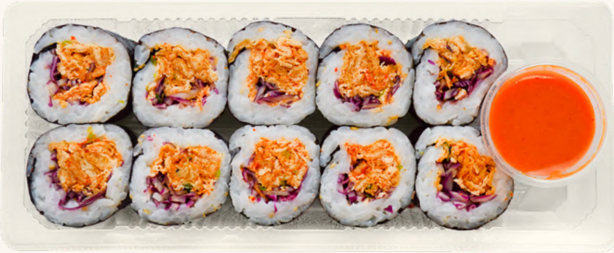
SPICY TOFU SAUCY ROLLS WITH SPICY GOCHUJANG MISO

Product Code: AZ4 Barcode: 5060005533076 Shelf Life: 4 Days